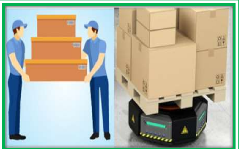
Energy Efficient usage